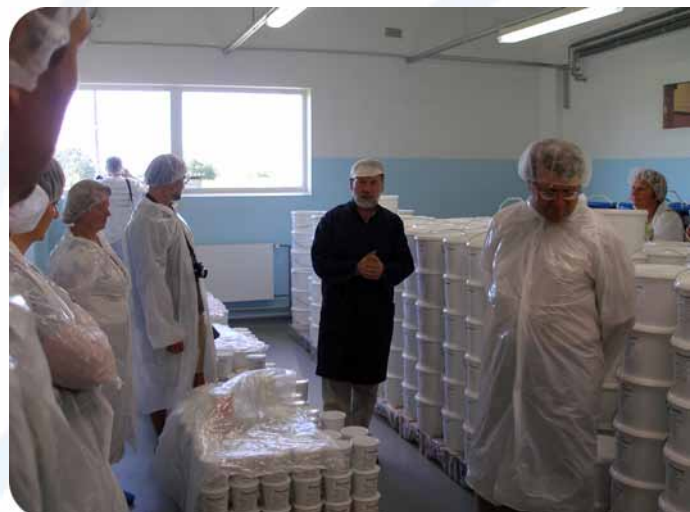
Picture 1: Field trip in Estonia with Latvian partners. Visit of the fruit and berry processors in Estonia.

The best wishes to the partners of the „GoodFruit” project and we all hope it will bring good results for fruit and berry producers, as well as consumers!