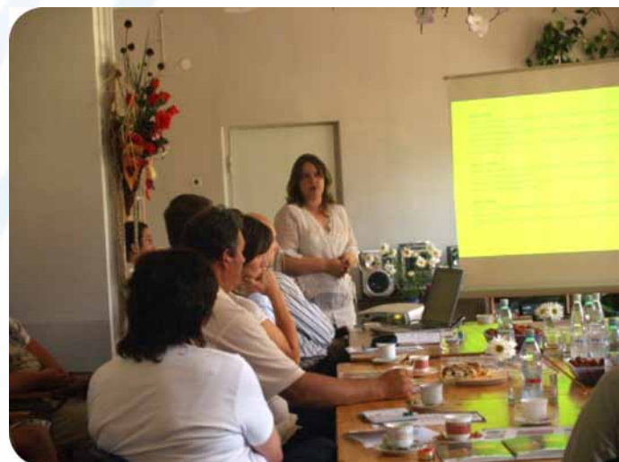
Picture 2: Seminar on July 24, 2008. Fruit storage in Estonia and Latvia. Situation and perspectives. Controlled atmosphere storage technology.