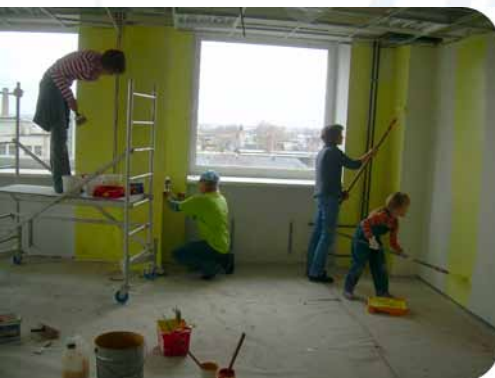
JTS staff painting their new office in Tartu