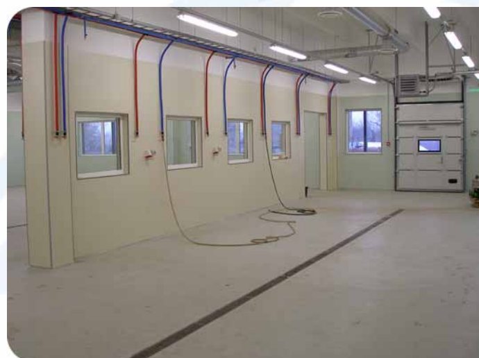
Picture 3: Refurbished facilities at the future pilot centre for processing and development of horticultural products at Polli Horticultural Research Centre.